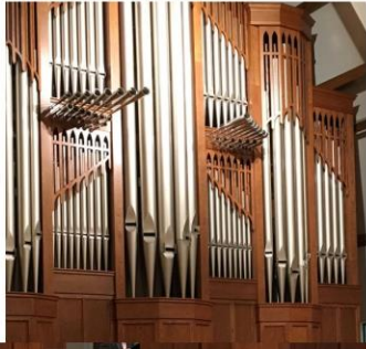
St. Matthew's ELCA Lutheran