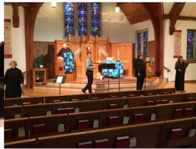
Voices and Verses — Karel Suchy