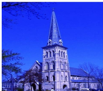
All Saints Cathedral Choir