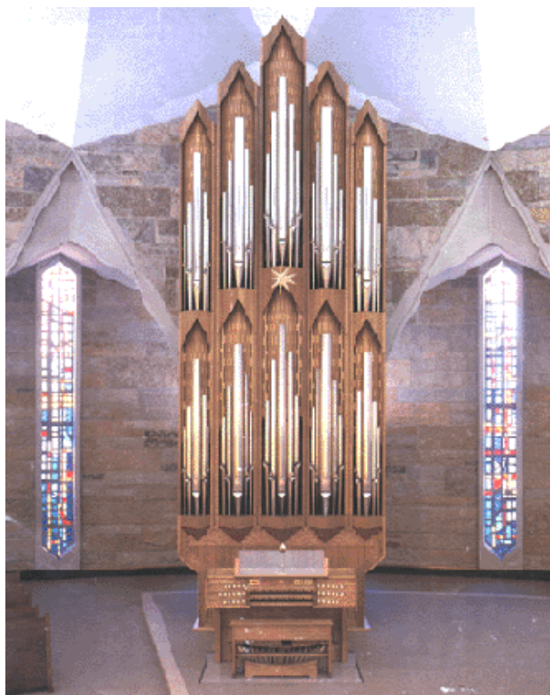
The Sacred Heart Berghaus

The recital will be preceded by the Annual Meeting at 2PM and followed by a reception in the seminary lobby. Yes, this recital will be longer than the usual but it’s the Bach “Great 18”!