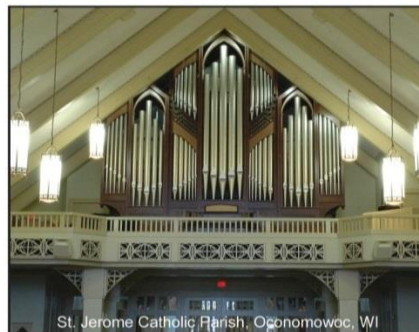
St. Jerome Catholic Parish, Oconomowoc, WI

708-544-4052 • info@berghausorgan.com • 2151 Madison St., Bellwood, IL 60104 • www.berghausorgan.com