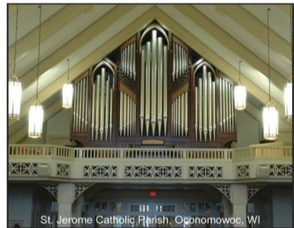
St. Jerome Catholic Parish, Oconomowoc, WI

708-544-4052 • info@berghausorgan.com • 2151 Madison St., Bellwood, IL 60104 • www.berghausorgan.com