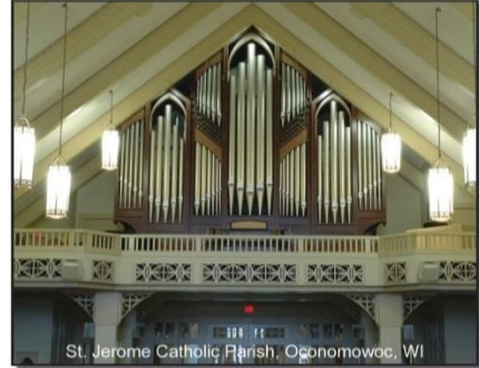
St. Jerome Catholic Parish, Oconomowoc, WI

708-544-4052 • info@berghausorgan.com • 2151 Madison St., Bellwood, IL 60104 • www.berghausorgan.com