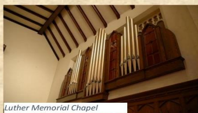
Luther Memorial Chapel

2019 AGO Milwaukee Chapter Organ Crawl March 9, 2019