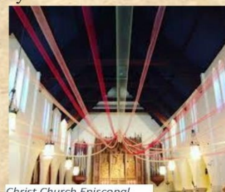
Christ Church Episcopal