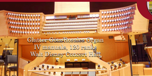
Glatter-Götz/Rosales Organ IV manuals, 120 ranks Walt Disney Concert Hall