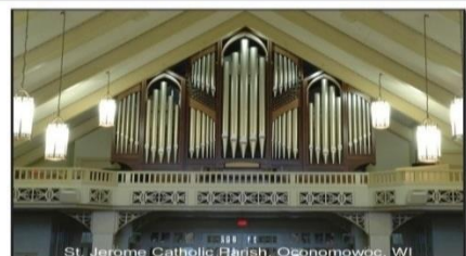
St. Jerome Catholic Parish, Oconomowoc, WI

708-544-4052 • info@berghausorgan.com • 2151 Madison St., Bellwood, IL 60104 • www.berghausorgan.com