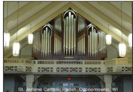
St. Jerome Catholic Parish, Oconomowoc, WI

708-544-4052 • info@berghausorgan.com • 2151 Madison St., Bellwood, IL 60104 • www.berghausorgan.com