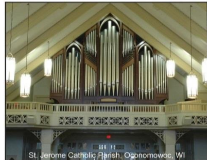
St. Jerome Catholic Parish, Oconomowoc, WI

708-544-4052 • info@berghausorgan.com • 2151 Madison St., Bellwood, IL 60104 • www.berghausorgan.com