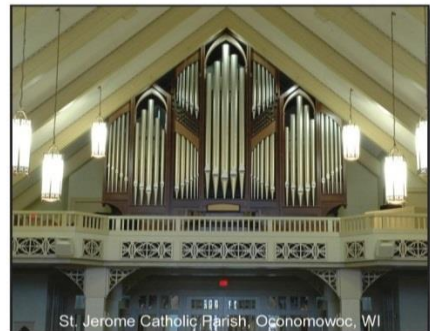
St. Jerome Catholic Parish, Oconomowoc, WI

708-544-4052 ● info@berghausorgan.com ● 2151 Madison St., Bellwood, IL 60104 ● www.berghausorgan.com