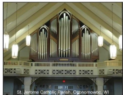
St. Jerome Catholic Parish, Oconomowoc, WI

708-544-4052 • info@berghausorgan.com • 2151 Madison St., Bellwood, IL 60104 • www.berghausorgan.com