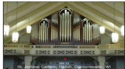
St. Jerome Catholic Parish, Oconomowoc, WI

708-544-4052 • info@berghausorgan.com • 2151 Madison St., Bellwood, IL 60104 • www.berghausorgan.com