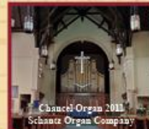
Chancel Organ 2011 Schantz Organ Company