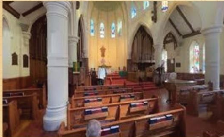
St. Matthew's Episcopal Church Skinner Organ Company Opus 505 1924 4/43