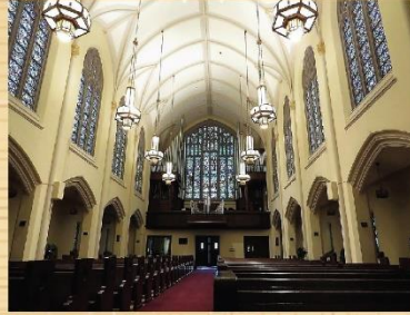
Holy Communion Lutheran Church Casavant Op. 3541 1982 3/42