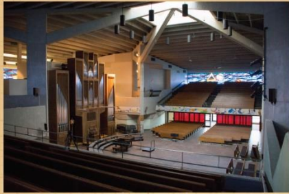
Carthage College Siebert Chapel Casavant Op. 3276 1975 4/63