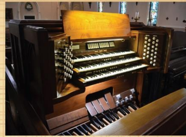
St. Luke's Episcopal Church Skinner Organ Company 1927/1942 3 manuals