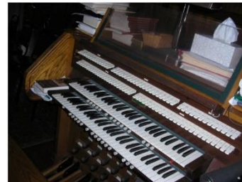
Left: First Congregational/Beloit—2001 Rieger-Kloss Middle and Right: St. Anthony/Milwaukee—Wangerin/Erickson

My school semester is almost finished and (Thank God!) I have no final exams. Among this week's assigned reading (for the Notation class that I spoke about above) is an article on "Improvisation and Musical Authorship in the Low Countries, 1450–1500." Can you imagine improvised polyphony? That was the norm at this time. Meanwhile, this quote struck my fancy: